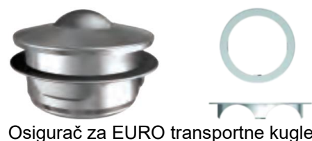
Osigurač za EURO transportne kugle